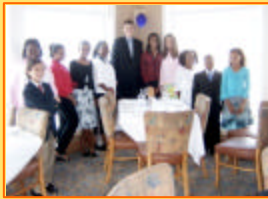
STUDENTS AND COUNSELORS POSE FOR A PHOTO AFTER DINING AT THE CHART HOUSE.