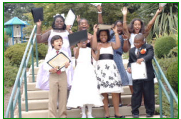
MEMBERS OF CLASS 3 CELEBRATE AFTER GRADUATION

The International Potluck Dinner and In-House Talent Show showcased talent and provided food from around the world. Students were encouraged to participate