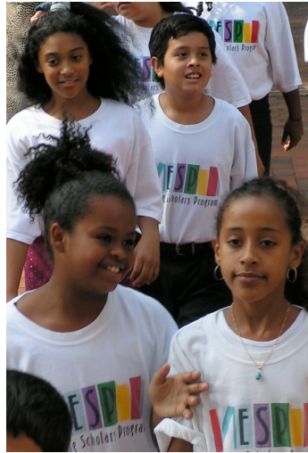
Cohort 3 on a field trip during the 2006 Summer Session