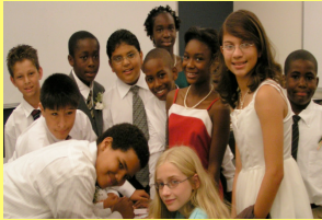
Cohort 2 in a celebratory moment before graduation

Spring at ESP is full of change and preparation. Saturday sessions are nearly complete and Class 3 is anticipating its second ESP summer, their final stage before graduation in August. Students have been accepted into their placement schools and will prepare their final speeches while finalizing their ESP education. Please read our September newsletter to find out what special surprise is being planned for our graduates!